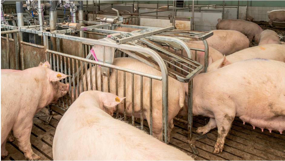
Individual feeding of every sow in a protected space

stalls and they can see the station's interior from outside, so they quickly learn how to use the system.